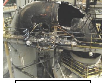
Fig. 2: After the fire

On September 21, 2020, a fire (Fig. 2) was ignited in a bucket of flammable resin being used to reline a Fiberglass Reinforced Plastic (FRP) tower at a papermill. Smoke and fumes from the fire killed two contractors. There are many lessons to be learned from this event. This Beacon will focus on the uncontrolled Hot Work aspect of the incident.