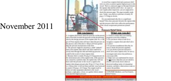
Figure 1 Process Safety Beacons across 20 years

Twenty years ago, a group of CCPS-member company representatives met and determined that a new process safety tool was needed. That tool was meant for frontline employees – mainly operations and maintenance personnel. The outcome was the CCPS Process Safety Beacon. From the first edition in November of 2001 as a text document, the committee has published it monthly and it is now emailed to over 30,000 subscribers. The readership has grown from a few hundred to an estimated 1 million.