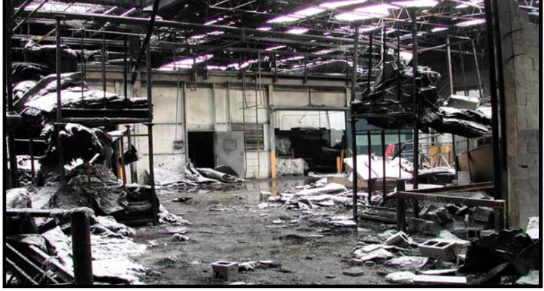
Photograph courtesy of The U. S. Chemical Safety and Hazard Investigation Board. Visit their web site at http://www.csb.gov for more information